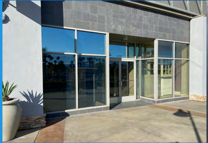
A-107 2,438 SF Ideal for Office/Retail