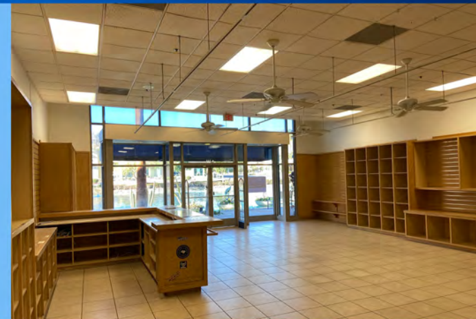
A-155 1,596 SF Ideal for Retail/ Home Furnishing