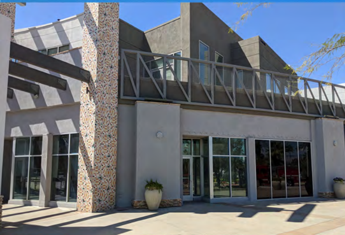
A-119 2,009 SF Improved Restaurant (Former Cafe)