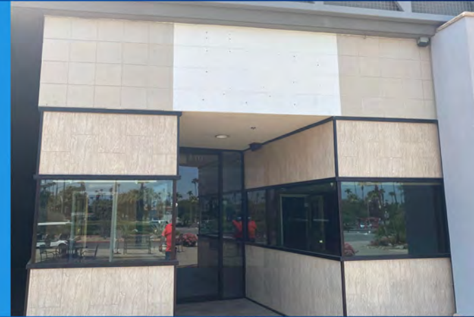
A-113 1,408 SF Ideal for Retail