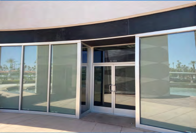
A-103 1,138 SF Ideal for office/Retail

71800 Highway 111, Suite A-208, Rancho Mirage, CA 92270 leasing@theriveratranchomirage.com (760) 341-2711